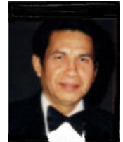
Dio Sore Auditor